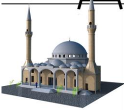
Masjid At taqwa Lahar Yooi